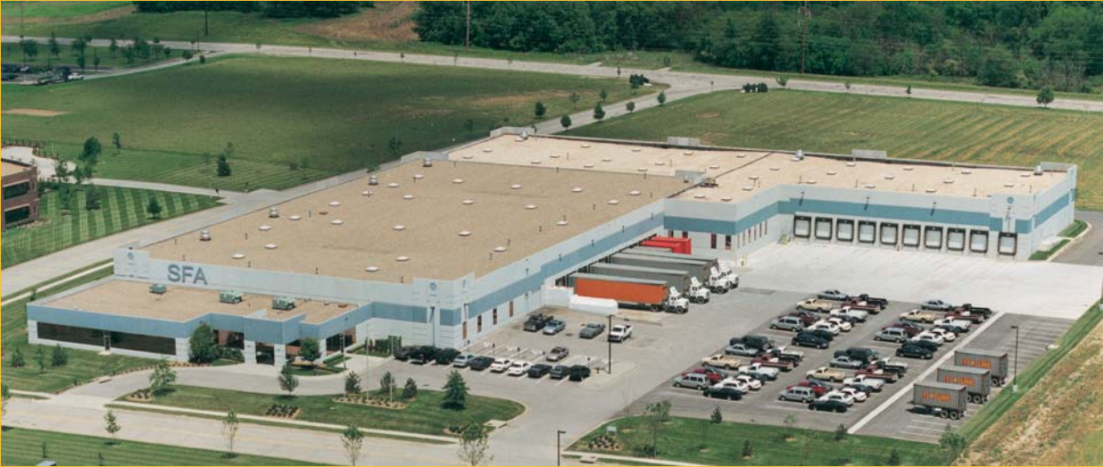
Kansas City, MO Manufacturing, Sales, Marketing, Engineering, and Distribution