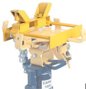
HW93721 Multipurpose Transmission Adapter (Optional, for use with HW93720)