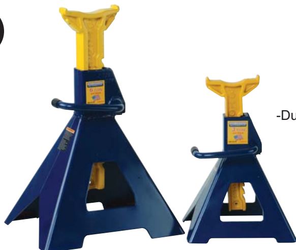
HW93506 and HW93503